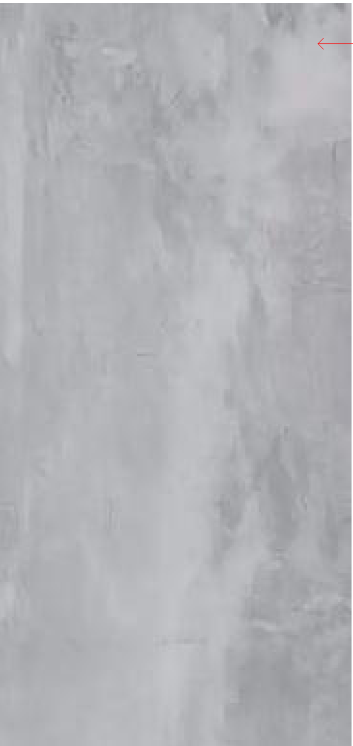
FC High Grade Fibre Cement Sheet (Concrete Finish)

CLARIFICATION: ROOF FASCIA FINISHING MATERIAL