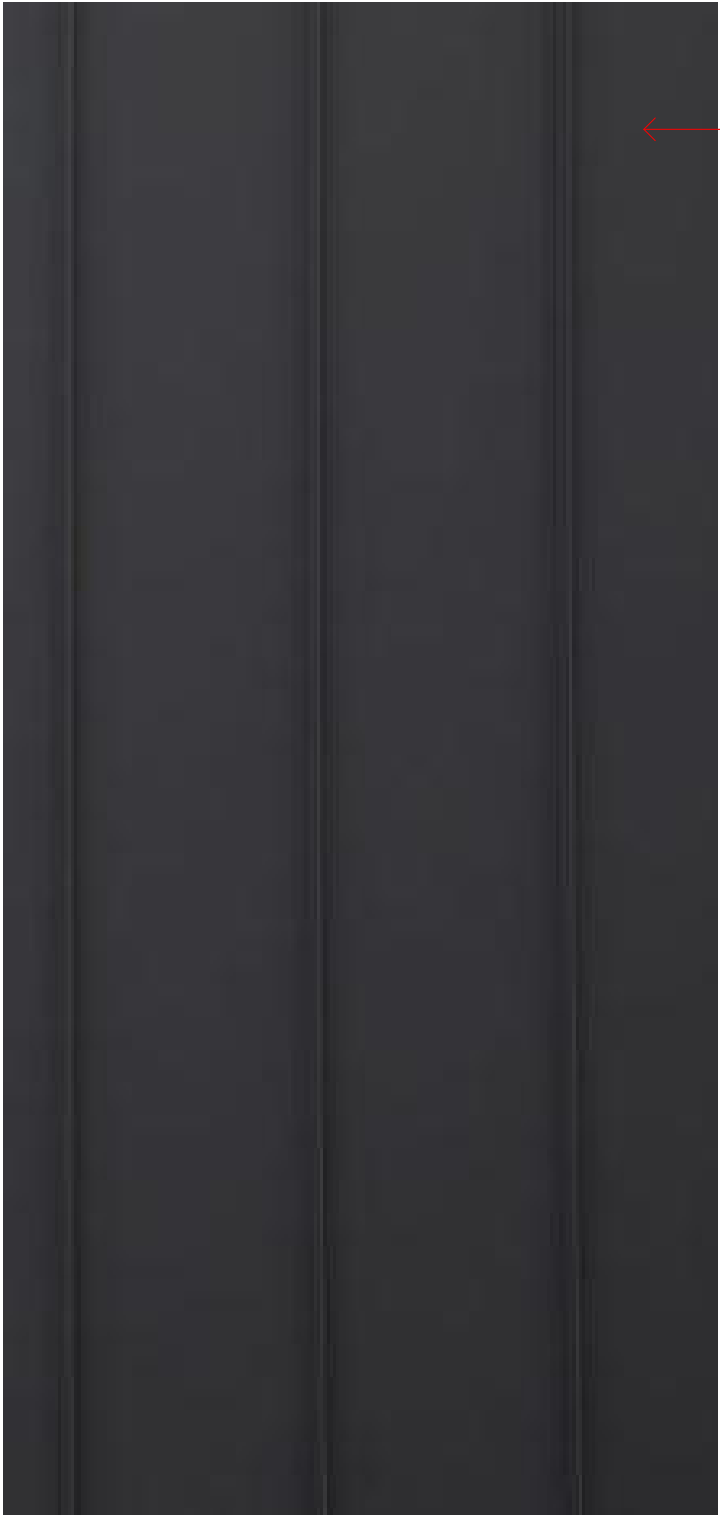
MT3 Metal Cladding (Type 3) NON-COMBUSTIBLE AS DEFINED BY BCA AND AS 1530.1

CLARIFICATION: WINDOW FRAME & WINDOW FRAME EXTENSION MATERIAL