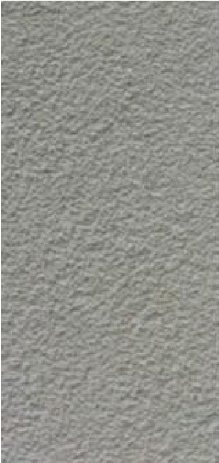
RM1 Rendered Masonry (Light)