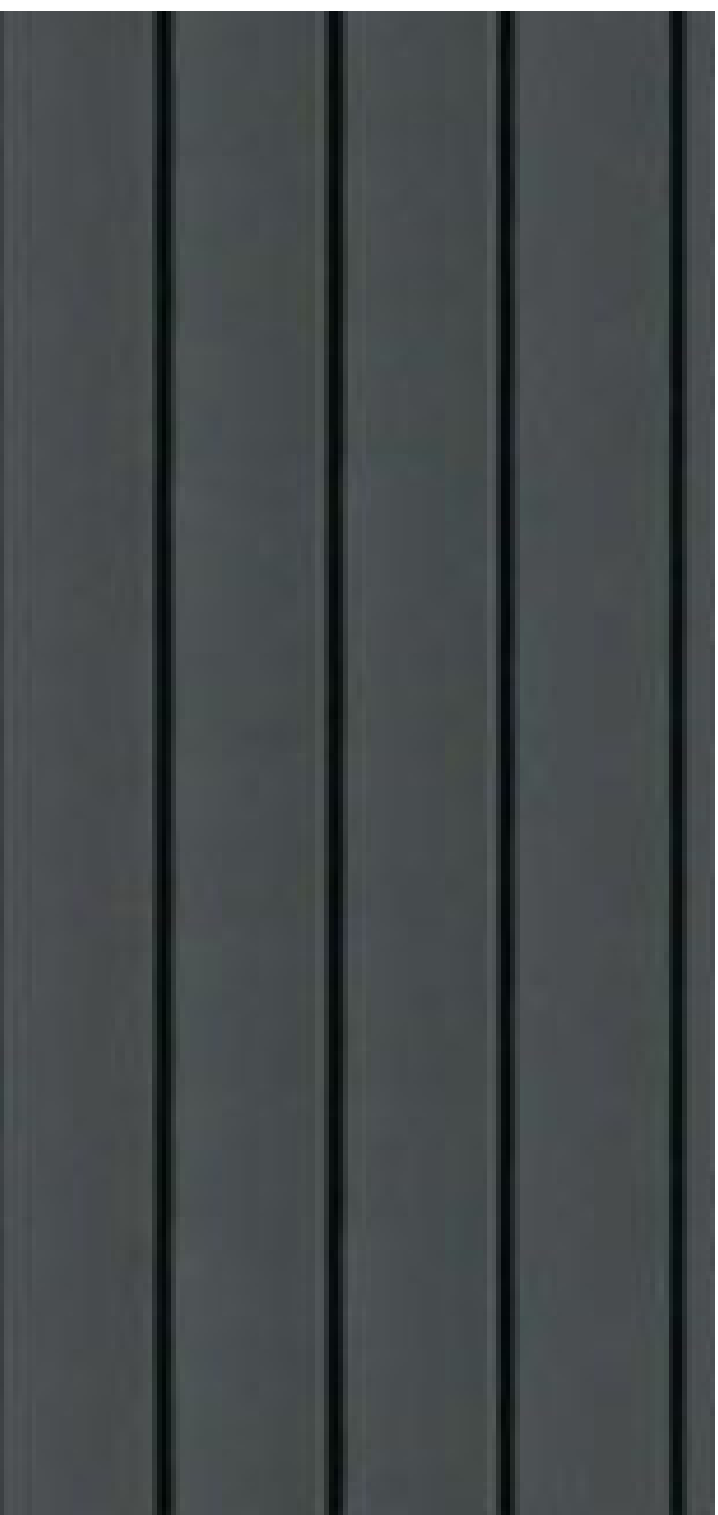
MT2 Metal Cladding (Type 2) NON-COMBUSTIBLE AS DEFINED BY BCA AND AS 1530.1