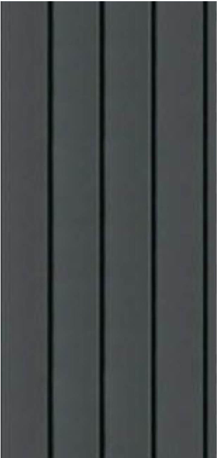
MDR Metal Deck Roof