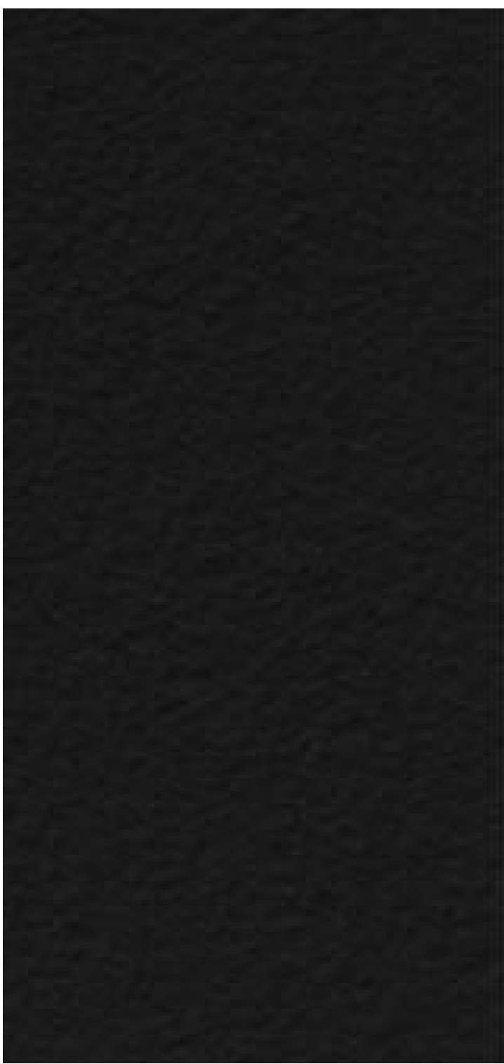
RM2 Rendered Masonry (Dark)