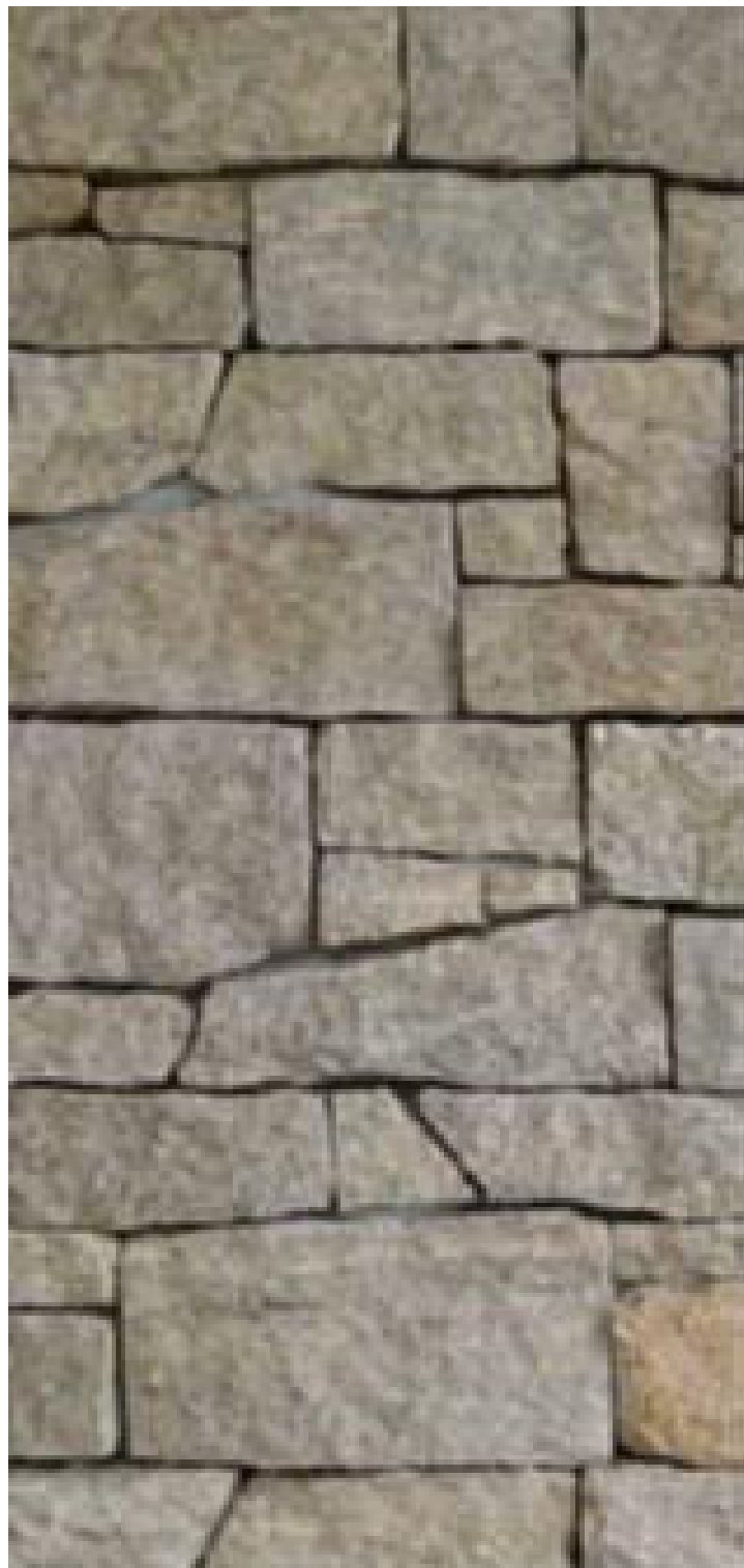
ST Stacked Stone