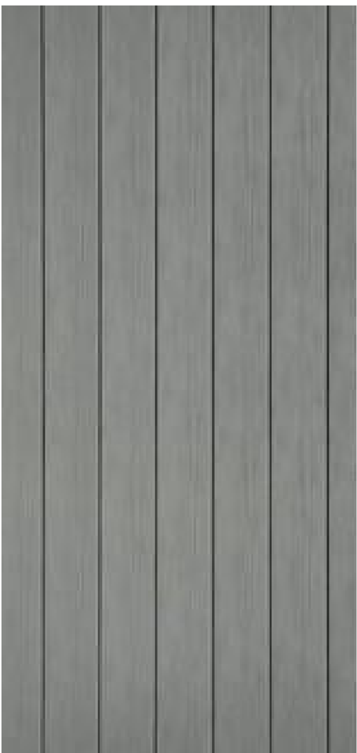
MT1 Metal Cladding (Type 1) NON-COMBUSTIBLE AS DEFINED BY BCA AND AS 1530.1